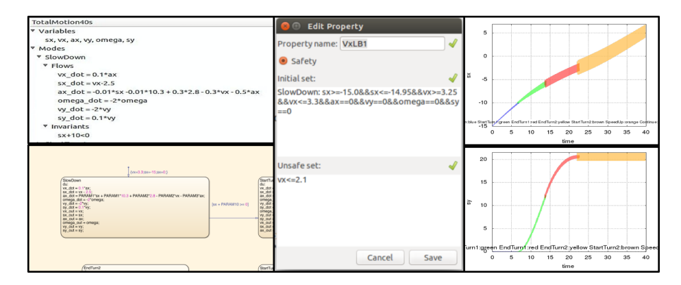
Fig. 2: Left to right: figures showing a snippet of partial adaptive cruise control model in C2E2 front end and Stateflow<sup>TM</sup>, property dialog, plots of reachable set for adaptive cruise control model.